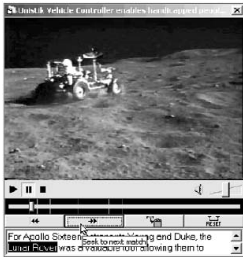
Fig. 1. Effects of seeking directly to a match point on "Lunar Rover," courtesy of tight transcript to video alignment provided by automatic speech processing

The Informedia Project at Carnegie Mellon University pioneered the use of speech recognition, image processing, and natural language understanding to automatically produce metadata for video libraries (Wactlar et al. 1999). The integration of these techniques provided for efficient navigation to points of interest within the video. For example, speech recognition and alignment allows the user to jump to points in the video where a specific term is mentioned, as illustrated in figure 1.