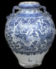
Ceramic Vessel, ca. 1700. Hispanic Society of America.