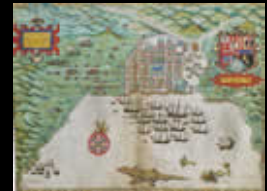
Attack on Santo Domingo, 1588. From Expeditio Francisci Draki... American Museum in Britain.