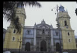
Cathedral, late 16th -17th c., rebuilt after 1746. Lima, Peru.