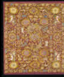
Chinese-Influenced Cover, late 17th- early 18th c. Boston Museum of Fine Arts.