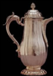
Coffee pot, ca. 1780. IFAC-MOIFA.