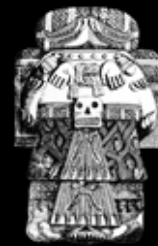
Coatlicue, 1792.