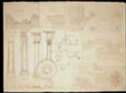
Architectural drawing, 1685.