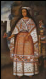
Portrait of a Ñusta, early 18th c. Museo Inka.