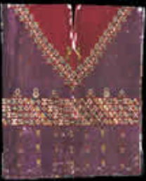
Unku with Heraldry, 16th c. Private Collection.