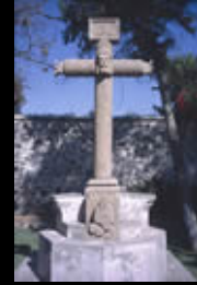
Atrio Cross, 16th c. Acolman, Mexico.