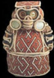
Zemi, ca. 1510-15. Museo Nazionale Preistorico ed Etnografico "Luigi Pigorini."