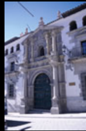
Casa de la Moneda, 1759-1773. Potosí, Bolivia.