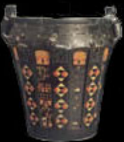
Kero, late 16th c. Museo Inka.