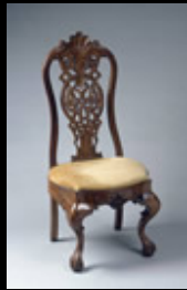
Chair, mid-late 18th c. San Antonio Museum of Art.