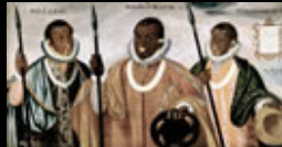
The Mulatto Gentlemen of Esmeraldas, 1599. Museo de América.