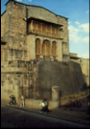
Korikancha/Santo Domingo, 15-16th c. Cuzco, Peru.