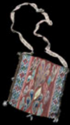
Coca Leaf Bag, 17th c. San Antonio Museum of Art.