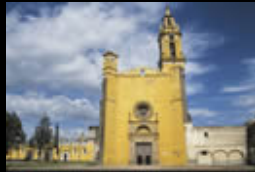
San Gabriel, 16th c. Cholula, Mexico.