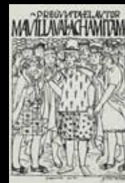
New Chronicle and Good Government , ca. 1615. Royal Library, Copenhagen.