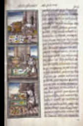
Florentine Codex, Book IX, ca. 1570-1585. Biblioteca Medicea Laurenziana.