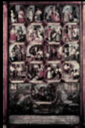
Casta Painting, 1777. Real Academia Española de la Lengua.