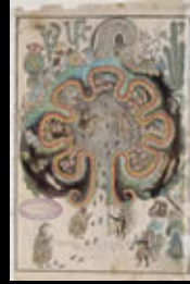
Historia Tolteca-Chichimeca, ca. 1550. Bibliothèque Nationale.