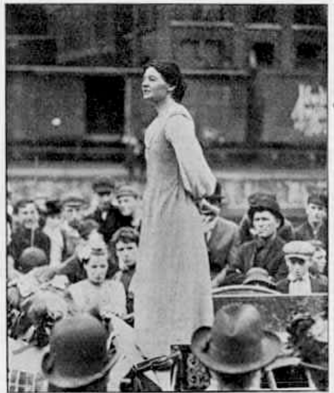
A SUFFRAGE STREET MEETING.