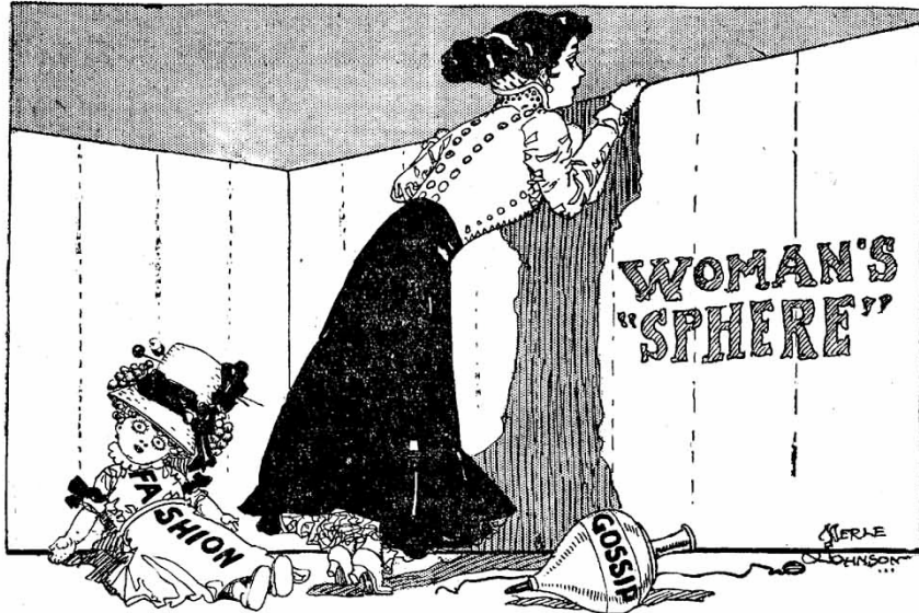
Woman Devotes Her Time to Gossip and Clothes Because She Has Nothing Else to Talk About. Give Her Broader Interests and She Will Cease to Be Vain and Frivolous.