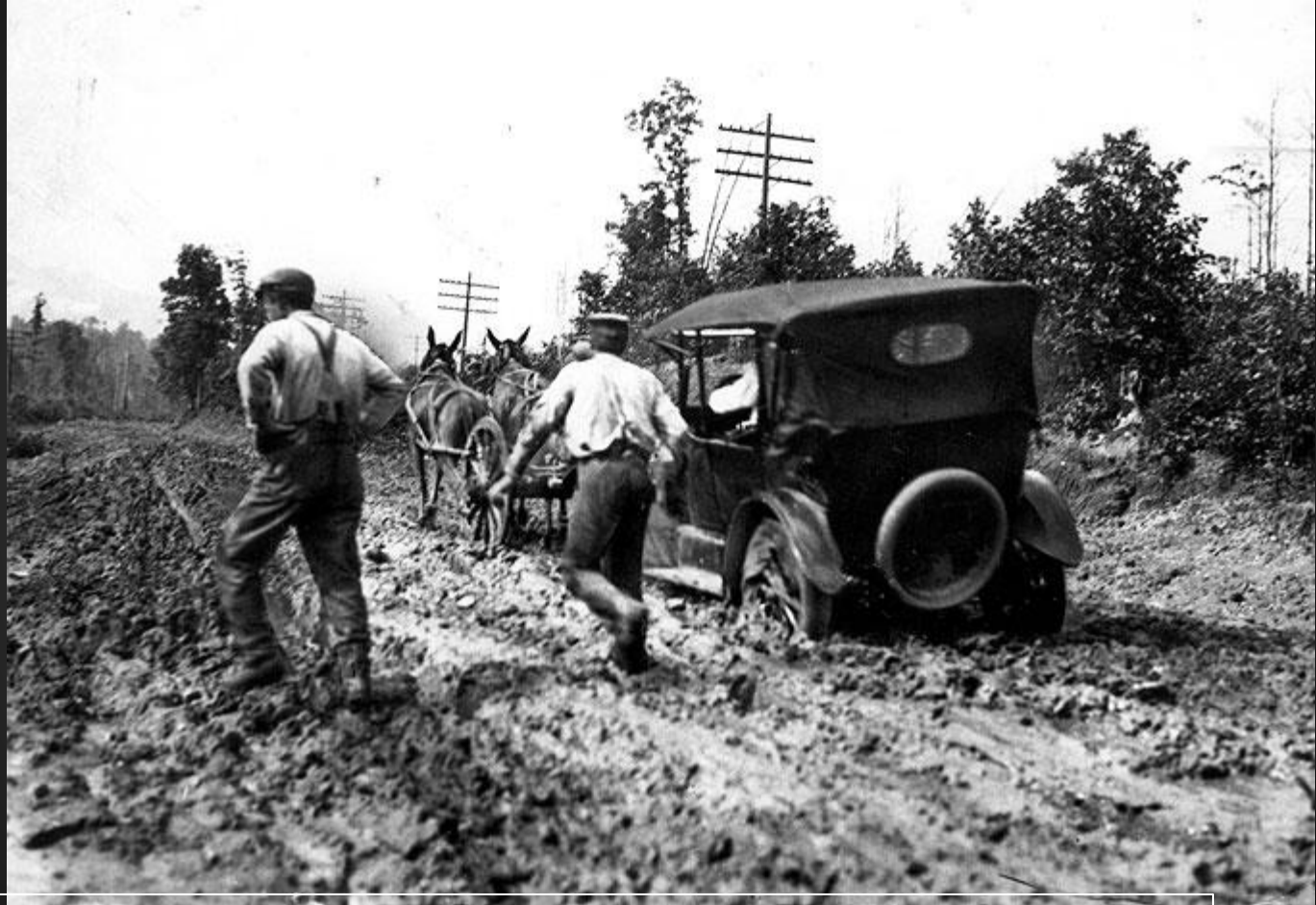
Auto Being Dragged Out of the Mud, 1917