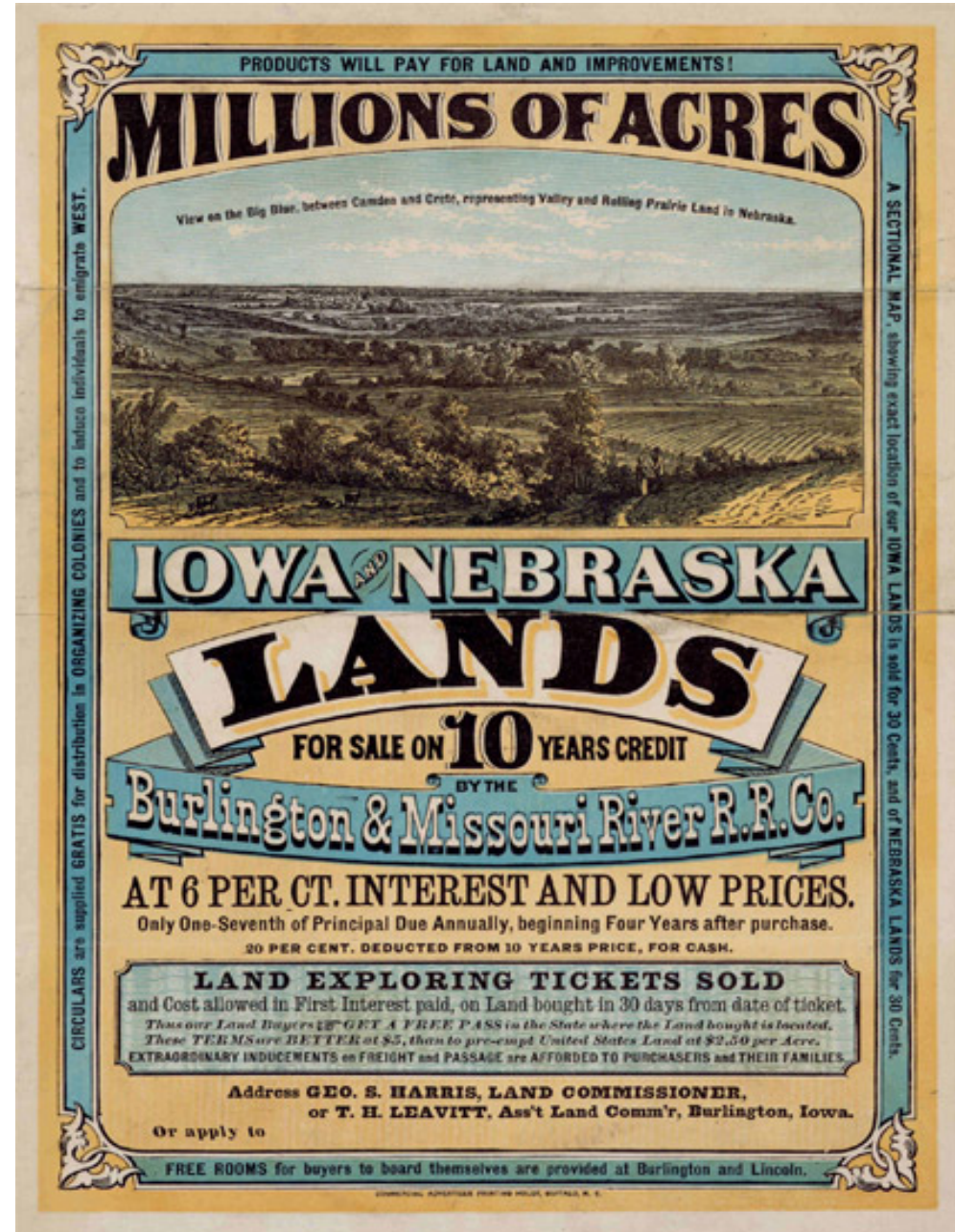
Primary Source 1: